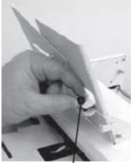
Skew Adjustment Knob